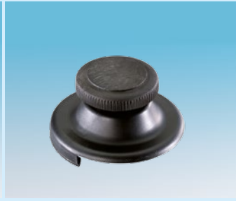
Air inlet valve for flat fitting