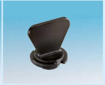
Air inlet valve for basket fitting

Party-KEGs from SCHÄFER: simply knock in the tap and the fun can begin: Enjoy tapping fresh draught beer.