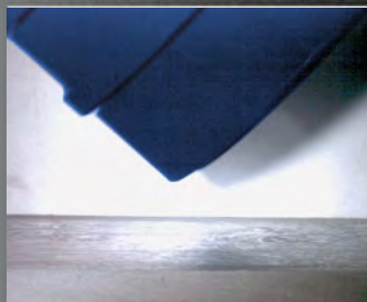
Drop test: 30 l PLUS KEG, full Height 120 cm, angle 45°