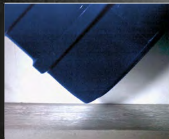
Impact resilience: the PLUS KEG remains undamaged