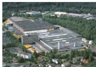
Plant Betzdorf Germany