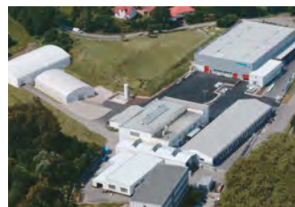
Plant Ledec nad Sázavou Czech Republic