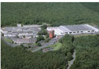
Plant Neunkirchen Germany